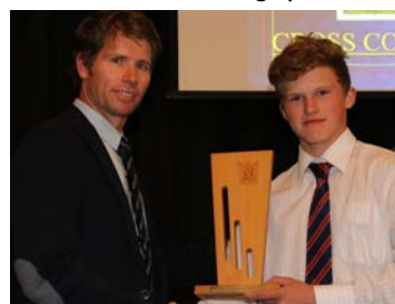
Team of the Year Cross Country Motorcross