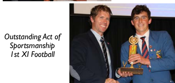
Outstanding Act of Sportsmanship 1st XI Football