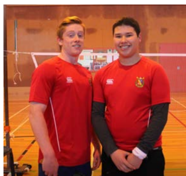
Table Tennis Coaching

Central Table Tennis are running a coaching programme in Term 3. It is open to all students aged 10-15. The venue is Methodist Church Hall between 6-7pm on Thursday evenings. The cost is $20.00. Booking is essential delwynjsingh@hotmail.com