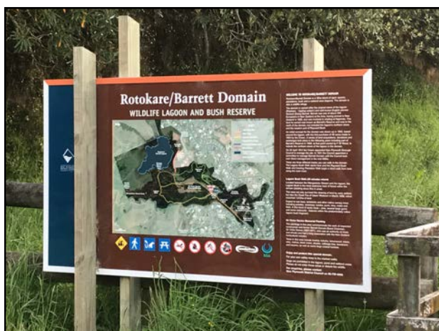
Boys go for a walk to Barrett Domain

Lists of required items for all class levels are available from the Office for those who wish to purchase elsewhere.