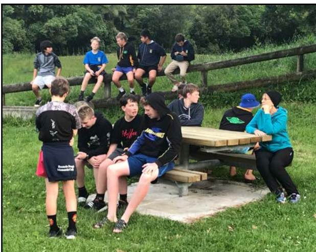
Boys at Barrett Domain